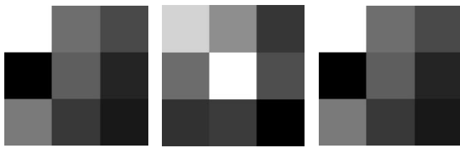
Fig. 1. Image blocks in ex.2 & ex.3. Left: original image f(x,y) . Middle: blurred g(x,y) . Right: estimated image \hat{f}(x,y)