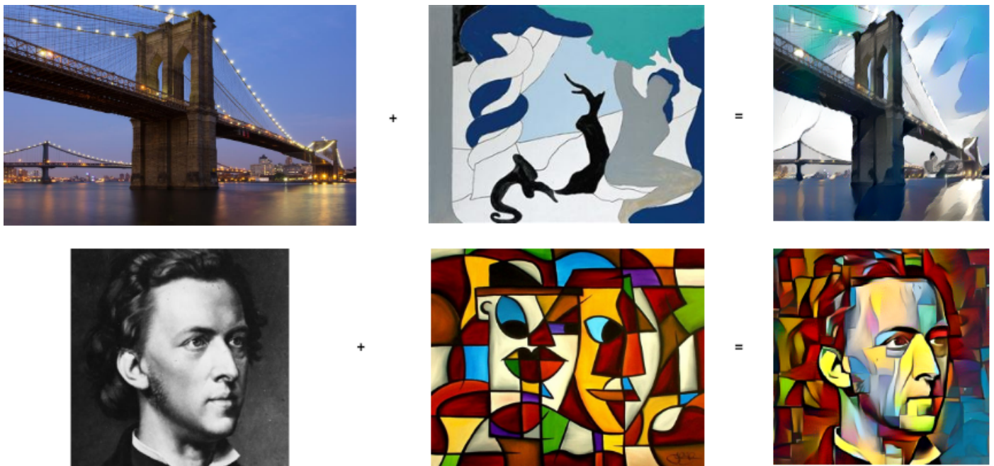
Fig. 1. Two examples of image style transfer generated using the neural style algorithm of Gatys et al. On the left is the content image, in the center, the style image, and on the right, the image generated via the ‘neural-style’ algorithm.

networks with different initializations will learn the same or even similar representations [12]. Despite the limited theory underpinning their use, the learned representations of neural networks have been used effectively for a wide range of tasks in recent years, including, in the computer vision domain, image classification, object detection, semantic segmentation, instance segmentation, and style transfer, among others. For instance, to perform instance segmentation of natural images, the state of the art Mask-RCNN model first extracts the learned representations of the data at various layers in a so-called ‘backbone’ convolutional neural network that has typically been pretrained for image classification. The model then uses these representations as input into several smaller convolutional neural networks [4].