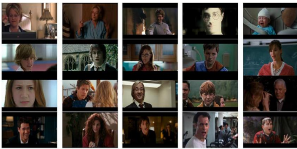
Fig. 1. Facial Emotions. different Human Emotion are Depicted from their Faces in the Provided Sample Images.