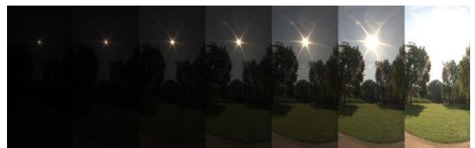
Fig. 2. An HDR Sunny Scene Captured with different Exposure Settings of a Standard Camera.