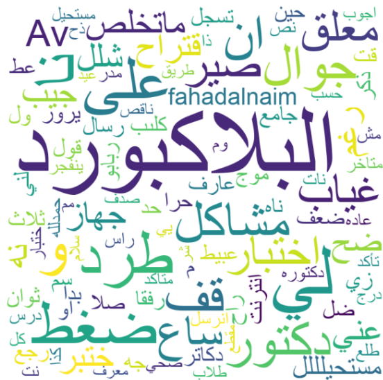
Fig. 4. Negative WordCloud.

GHz cpu and 16.0 GB memory as support for the whole experiment and we used Python as the language of programming. We used a machine learning model by Naive Bayes, RF and KNN Classifiers. We split our data into 80% train and 20% test sets. We got 77% of Naive Bayes, 84% of RF and 67% of KNN Classifier.