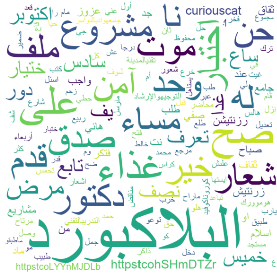
Fig. 3. Positive WordCloud.

Our research was centered on Twitter's opinion mining and sentiment analysis about online learning during COVID-19 pandemic, which bifurcates tweets based on three categories: positive, negative and neutral. Our goal was to get a better understanding of the feelings and opinions of tweeters about online learning. To do so, we collected about 10445 tweets. After that we applied sentiment analysis to these tweets and measured sentimental characteristics of tweets, such as polarity and subjectivity, using TextBlob. We got that most tweets were expressing a neutral sentiment, that might have happened because most of the tweets contained sentences that does not express negative nor positive emotions. One of the key challenges, however, is the lack of resources to be able to analyze the Arabic language, especially that each country has different colloquial Arabic. As for future work, we plan to understand people's attitudes towards different platforms of online learning via sentiment analysis of the feelings shared by the public about these platforms.