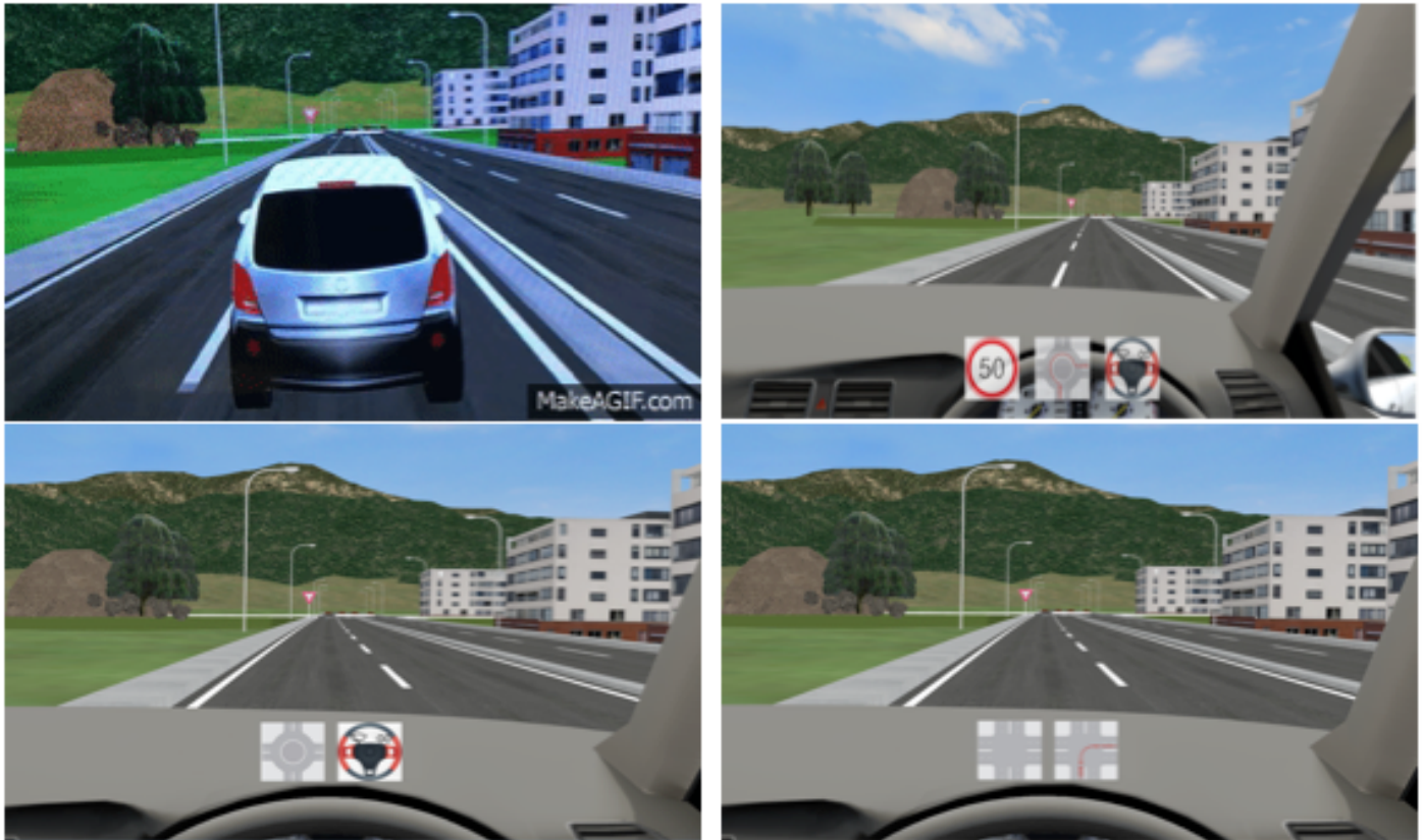
Fig. 2. Some Images used in the Usability Questionnaire.