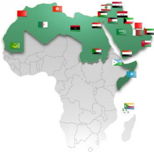
Fig. 1. Arab region map.

Google Trends ( https://trends.google.com/trends/ ) reveals that the interest in SL among Arab individuals in the Arab region over the past five years, across four states or more in each country, has resulted in the numbers shown in Table I. These numbers indicate the rate of interest in the web search for "Second Life" term specifically, and we calculate this rate by comparing it to the highest point in the graph for the specific region and period, i.e. the value "100" represents the peak popularity of the search term compared to other search words in the same region, while the value "50" represents half the popularity of this phrase. For absent countries, there is not enough data available for this search term.