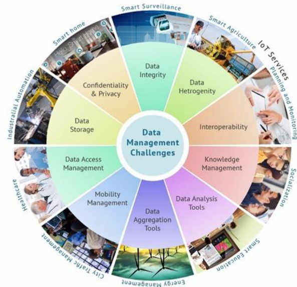
Fig. 1. IoT Services and Data Management Challenges

represents current challenges identified in IoT services. These challenges mainly involve data integrity, data heterogeneity, knowledge management and data analysis tools. The detail of the challenges is given as follows: