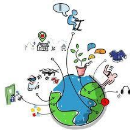
Fig. 1. Internet of Things.

specific locations of a country, their patients also reside closer or at moderate distance from these hospitals. If these patients need physical checkups then they can easily visit these hospitals.